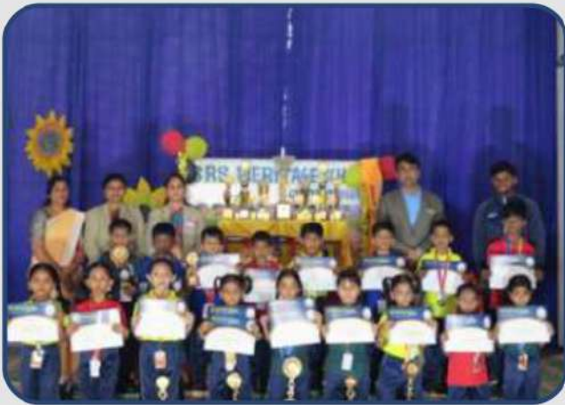
AWARDS' DAY CELEBRATION