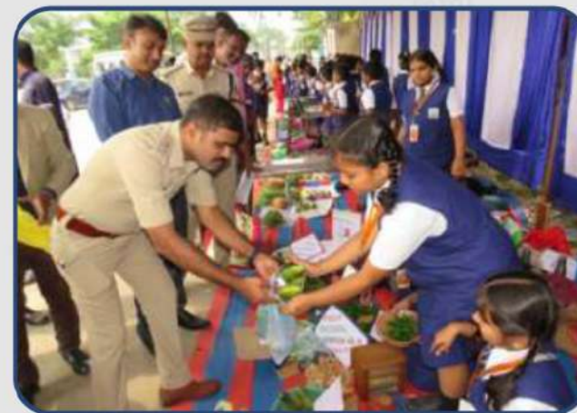
SRS VEGETABLE MELA