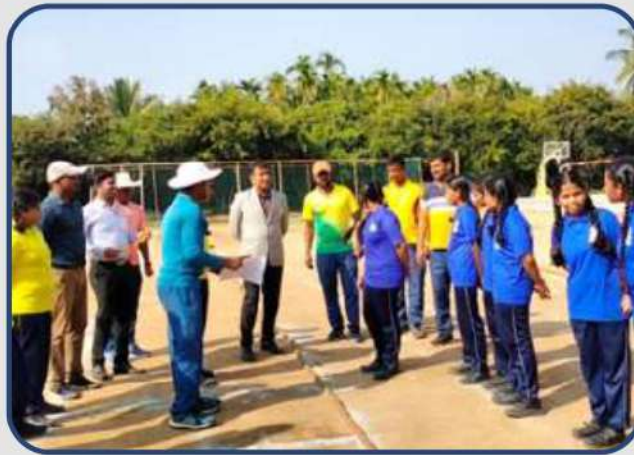
ZONAL LEVEL SPORTS MEET