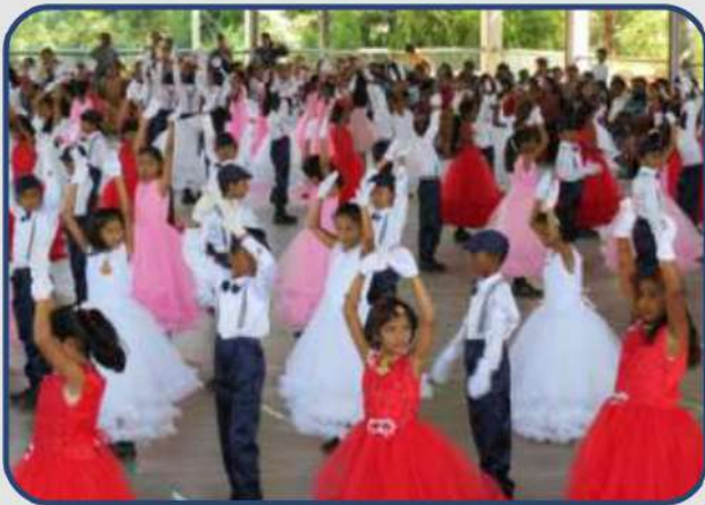
PARENTS' SPORTS MEET