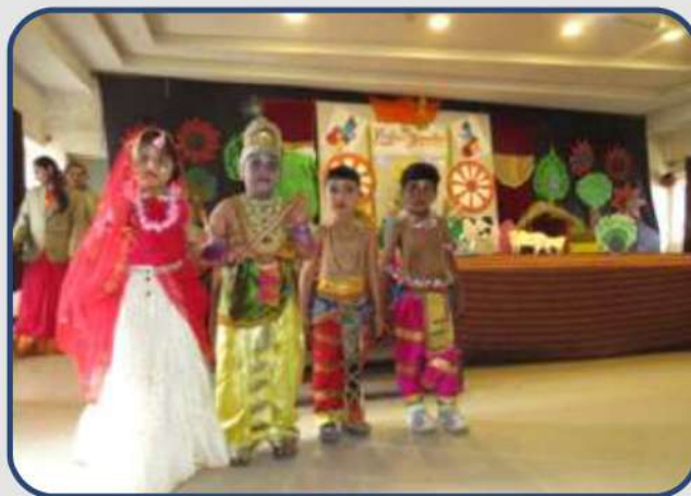
KRISHNA JANMASTAMI CELEBRATION