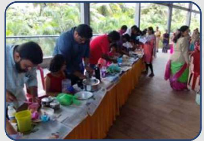
FATHER'S DAY CELEBRATION