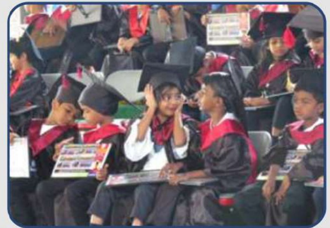
KG GRADUATION DAY