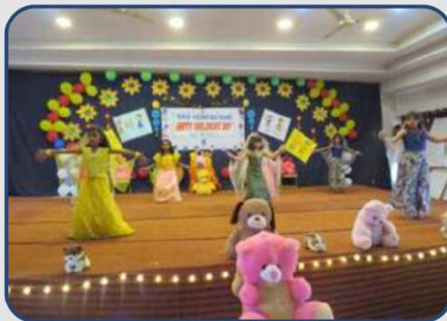
CHILDREN'S DAY CELEBRATION